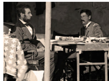
Photo of Lincoln and McClellan taken after Antietam.

On May 3, 1861 he re-entered federal service by being named commander of the Department of Ohio. On Nov. 1, 1861 Winfield Scott retired and McClellan became general-in-chief of all the Union armies. At age 35 he was referred to as a “Young Napoleon”. McClellan brought a great degree of organization to his new army and he greatly improved the morale of his troops. Lincoln was constantly pressing McClellan to be more aggressive in battle, but McClellan was often insubordinate to Lincoln. When McClellan failed to pursue Lee aggressively after Antietam, Lincoln ordered that he be removed from command on Nov. 5, 1862. In 1864 the Democrats nominated McClellan as their presidential candidate, but his campaign was inconsistent and difficult. After the war his family traveled in Europe and when he returned he became involved in various businesses and served a term as Governor of New Jersey.